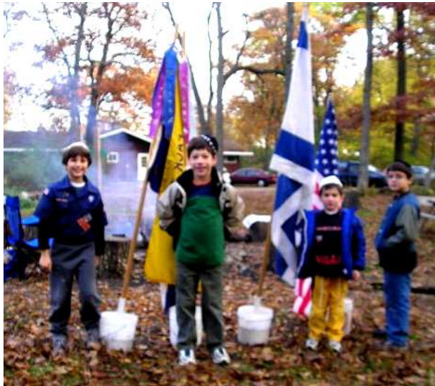
Bear Cubs conduct the opening flag ceremony

In the morning the Boy Scouts & Webelos restarted the fire & cooked “holes in the bucket” (toast with eggs in the middle) for all the attendees. Then the Bear Scouts ran an awesome flag ceremony. All then took a nature hike through the camp including a visit inside the castle which was a big hit.