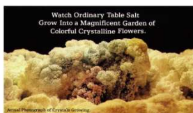
Salt crystals grown