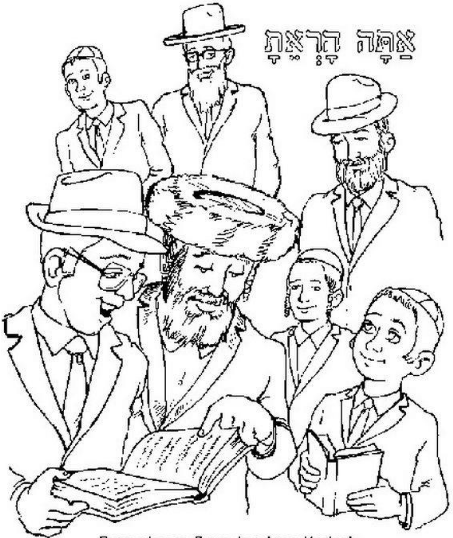
Preparing to Open the Aron Kodosh