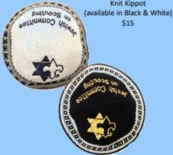
Knit Kippot (available in Black & White) $15