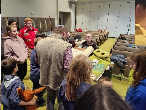
◀ ▶ Baden Powell Council 10 Commandments Hike