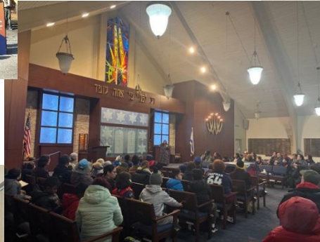
◀ ▶ Theodore Roosevelt Council 10 Commandments Hike