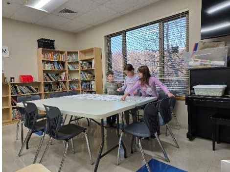
◀ ▶ ▶ Scouts in Baltimore Area Council participated in a Jewish Religious Emblems