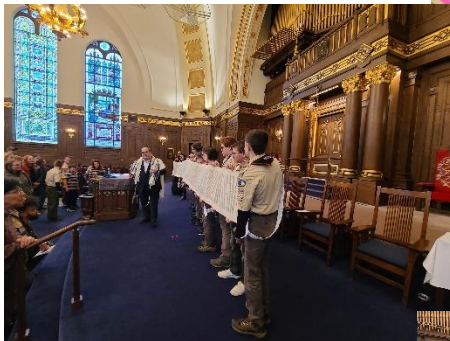
◀ ▶ ▶ Scouts in Laurel Highlands Council participated in a 17th Annual Ten Commandment and World Faiths Hike