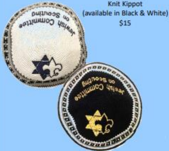
Knit Kippot (available in Black & White) $15