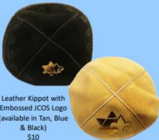
Leather Kippot with Embossed JCOS Logo (available in Tan, Blue & Black) $10