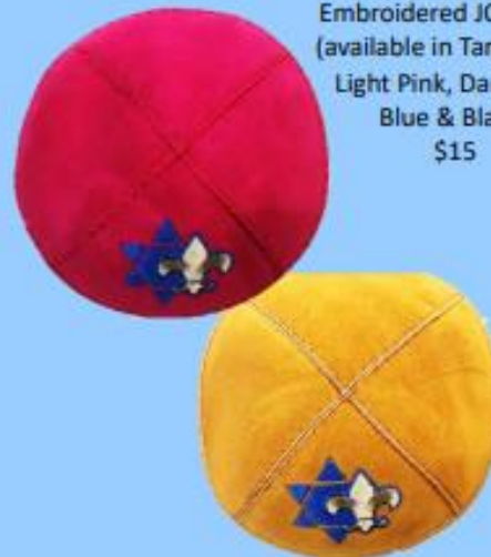
Leather Kippot with Embroidered JCOS Logo (available in Tan, Brown, Light Pink, Dark Pink, Blue & Black) $15