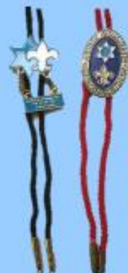
JCOS Bolo Ties (available with Black Cord or Red Cord) $15